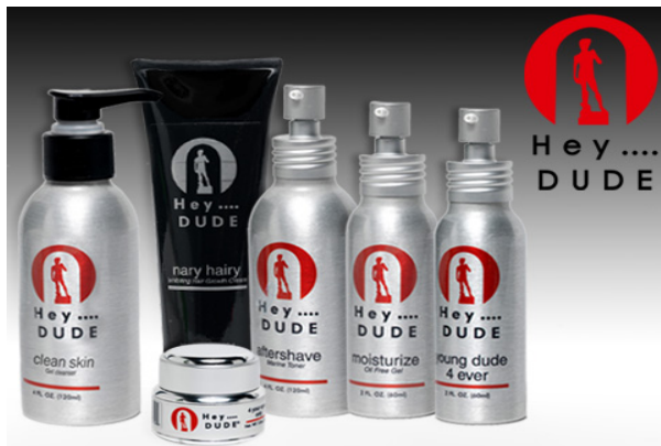
Previous Product Set

MEN'S SKINCARE COMPANY DELIVERS THE GOODS WITH NEW PRODUCTS AND PACKAGING