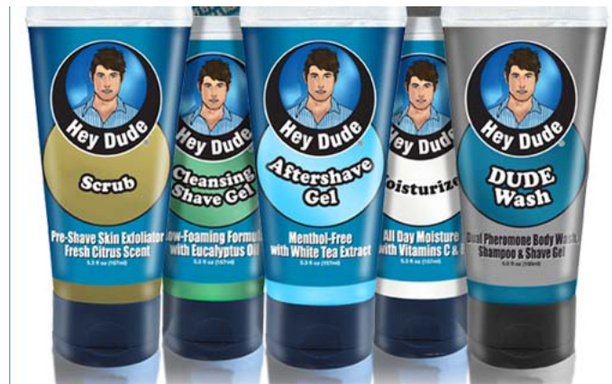
Newly Dudified Product Set

Miami Beach, Florida USA December 12, 2011. Hey Dude Skin Care announces that it has introduced a new series of men's skincare and grooming products that serves the needs of today's modern Dude. By replacing its past series of branded products with a simple, step-by-step system of products comprising a system it calls Dudification , Hey Dude Skin Care addresses all of the major grooming needs of guys – exfoliation, shaving, post-shave treatment, moisturizing, and sun protection.